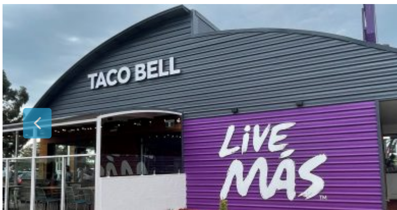
Taco Bell chooses Roxburgh Park for its first Victorian drive-thru